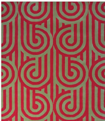
BRINK & CAMPMAN, Florence Broadhurst Collection