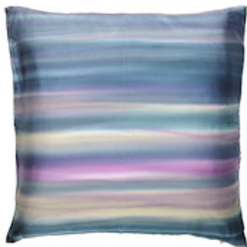
AVIVA STANOFF DESIGN