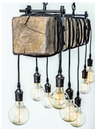
CARROLL BY DESIGN