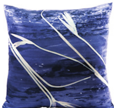
AVIVA STANOFF DESIGN