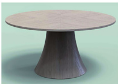
BELLE MEADE SIGNATURE