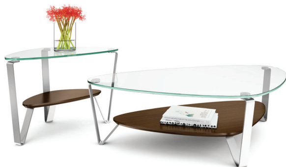
Dino End Table (1347) & Small Triangular Coffee Table (1344)