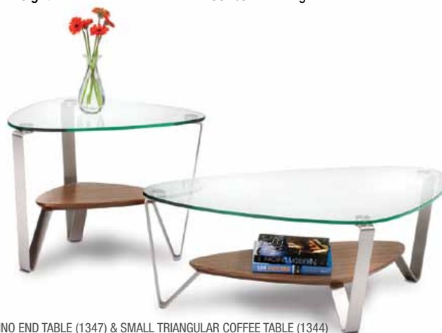
DINO END TABLE (1347) & SMALL TRIANGULAR COFFEE TABLE (1344)

Overall Dimensions (H x W x D) 21 x 29 x 21.25 in ■ 54 x 74 x 54 cm Shelf Clearance 11.4 in ■ 29 cm Weight 38 lbs ■ 17 kg